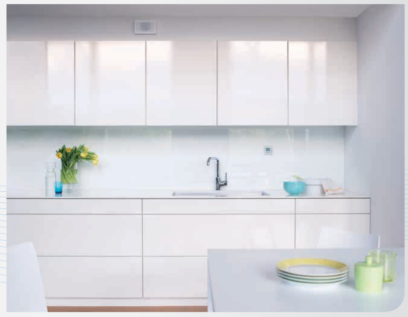
Installation solution for the kitchen - closed

Energy efficiency: more than 70% of the energy required in homes is used for heating. When windows are opened to let in air, valuable heat is let out – bad for the energy balance and your wallet.