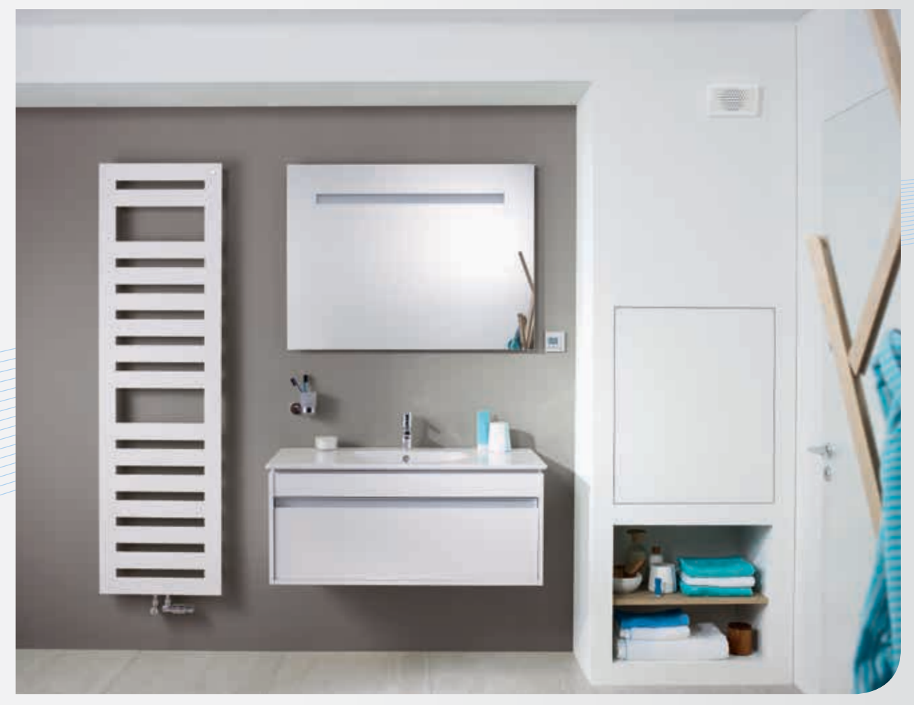
Installation solution for the bathroom - closed

Appearance: it is good when the apartment design has no restrictions: The elements of the ventilation system are concealed, leaving only the control unit and the supply and extract air valves visible.