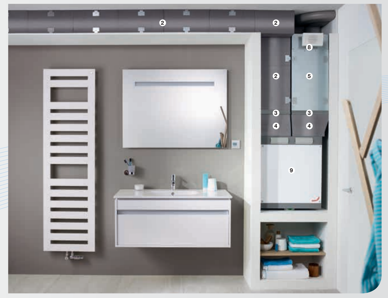
Installation solution for the bathroom - open

Easy installation: the compact ventilation system is quick and easy to install, both in new buildings and in renovation projects. Easy access to all components for servicing and maintenance.