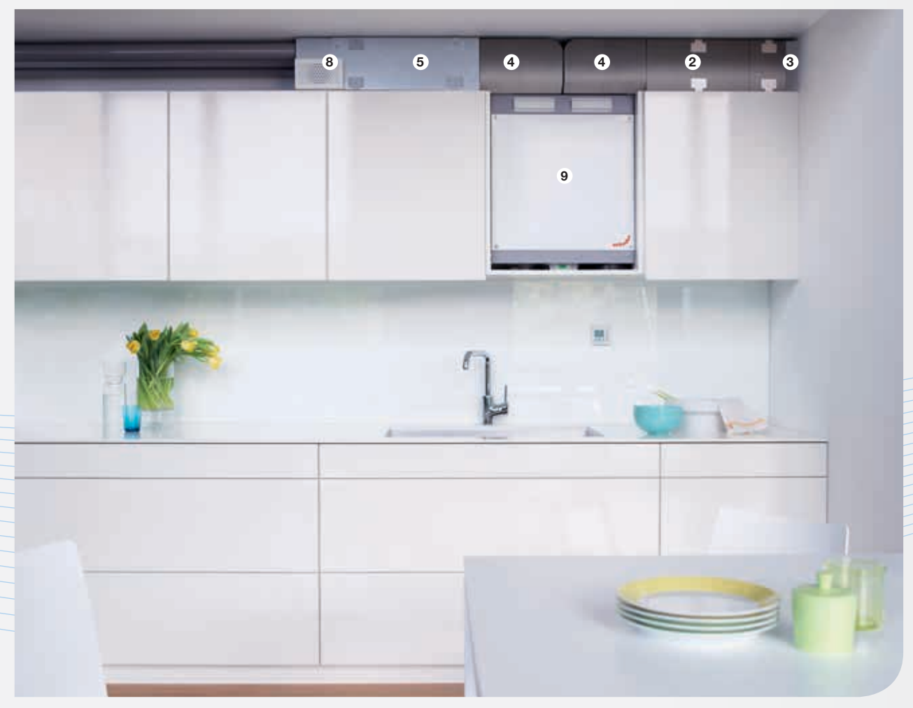
Installation solution for the kitchen - open

Fit for the future: Compliance with statutory requirements means that the system is eligible for government subsidies. The positive energy certificate rating upholds the value and continued marketability of the property.