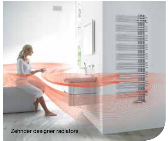
Zehnder designer radiators