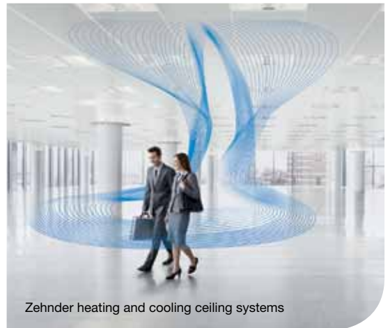
Zehnder heating and cooling ceiling systems