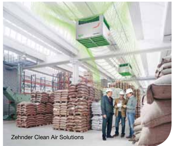
Zehnder Clean Air Solutions