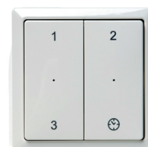
Wireless remote control